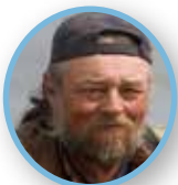
Shelter from the Storm Page 2