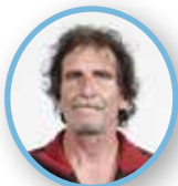
The Showers Must Be Fixed! Page 4