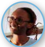
You Helped Transform a Young Person's Heart Page 3